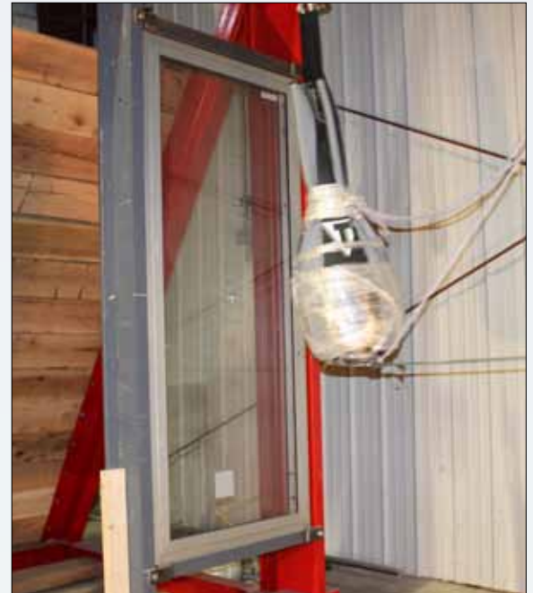
Swinging Test Weight (300-lb. weight) simulates impact of 250-lb. man.

Winco recognizes natural light promotes a healing environment for hospitals and mental health institutions. Our psychiatric windows are engineered to be robust and secure behind a non-institutional framing system with protective glazing that delivers natural daylight with the security and protection required for psychiatric care facilities.