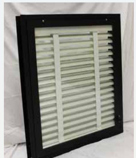
Adjustable, integral 2" blind option shown.