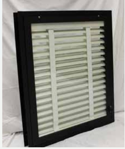
Adjustable, integral 2" blind option shown.