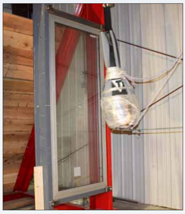
Swinging Test Weight (300-lb. weight)simulates impact of 250-lb. man.

Winco recognizes natural light promotes a healing environment for hospitals and mental health institutions. Our psychiatric windows are engineered to be robust and secure behind a non-institutional framing system with protective glazing that delivers natural daylight with the security and protection required for psychiatric care facilities.