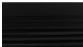
115-2S Class I Black Anodized