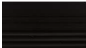
113-2S Class I Dark Bronze Anodized