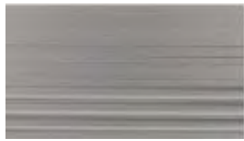
215-R1 Class II Clear Anodized