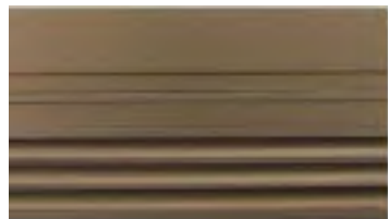
111-2S Class I Light Bronze Anodized