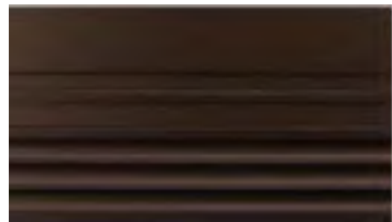
112-2S Class I Medium Bronze Anodized