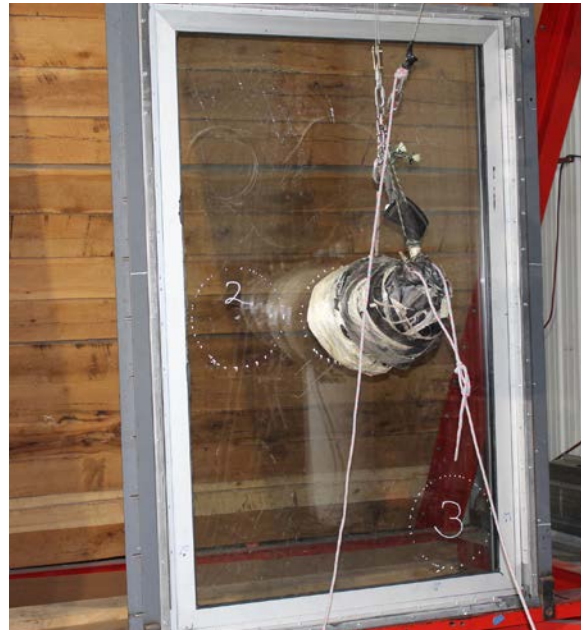
Swinging Test Weight of a 300-lb. weight, simulating the impact of a 250-lb. man 100