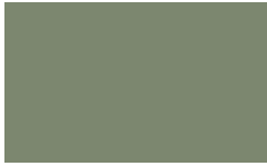
Patina Green LT616