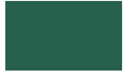
Dark Ivy LT617