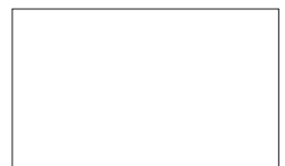
Whatever You Want