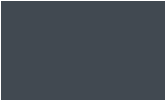
Charcoal Gray LT605