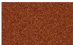
Classic Copper LT727