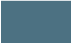
Military Blue LT610