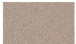
Champagne Pearl LT728